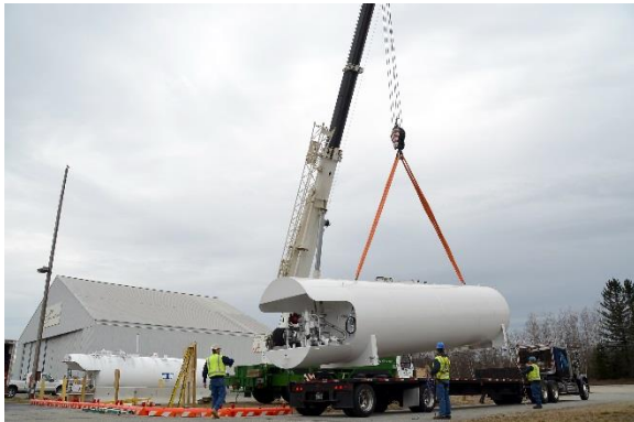
Jet-A Fuel storage tank being put in place

Annual report time means one more year has flown by. As usual we had a busy year at the Berlin Regional airport. Work continues on our Capital Improvement Project to replace our Jet-A Fuel storage tank system with a new one. The ground work and cement work was done in the fall with the tank being delivered and put into place in May.