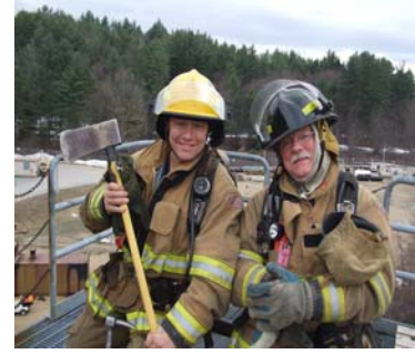
New Hampshire Fire Academy Fire Ops 101, Concord, NH