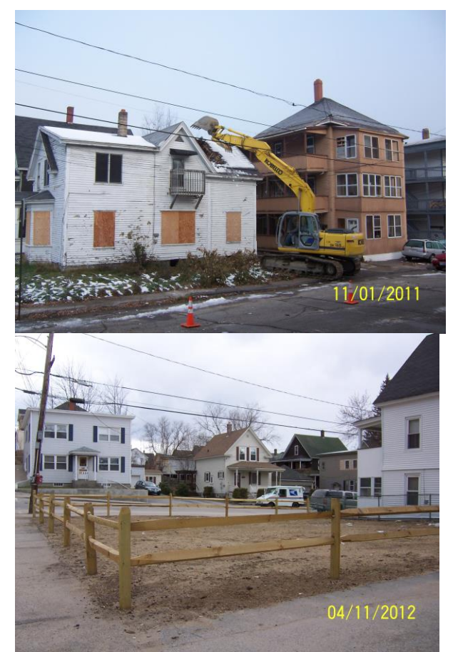
249 E. Mason... before 249 E. Mason... after

The City has been unwavering in its commitment to address blight and substandard housing throughout neighborhoods. Budgeted municipal funds, Neighborhood Stabilization dollars, and an EDI-Special Projects grant, have enabled us to move forward aggressively with the abatement and demolition of blighted housing.