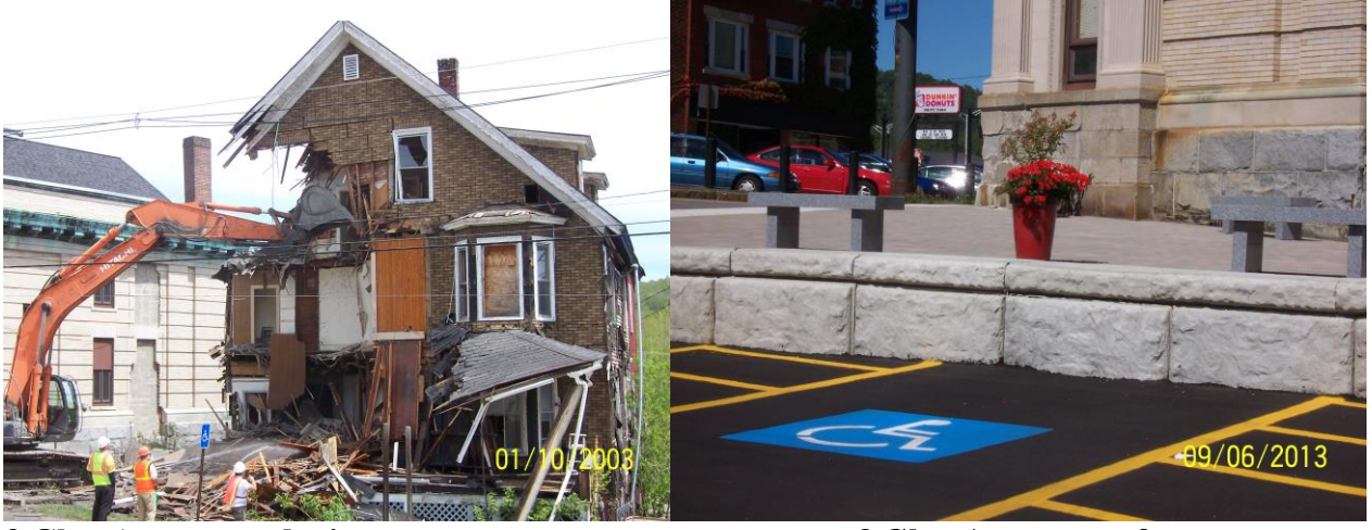
3 Glen Avenue.... during

with the abatement and demolition of blighted housing. From 2007 to the present, $2,858,240.00 from these combined sources have contributed to the removal of 57 blighted buildings (representing 178 Units ) in the City of Berlin.