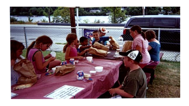
Children enjoying lunch from the USDA sponsored Lunch Program

Departmental cooperation was the name of the game this summer as the North Country Men's Basketball league had the Berlin Junior High access to gymnasium. Many summer nights the Junior High was host to a gym full of spectators watching some exciting basketball games. The Men's League also gave back to the community with their fund raising event, a Free Throw and Dunking Contest, raising funds for area military families. Use of the Berlin Junior High allowed for greater attendance and we appreciate the school's support in this activity.