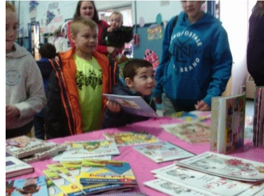
Children choosing CLIF books

the advice given will better prepare us to offer information on available services as well as listening with a non-judgmental ear.