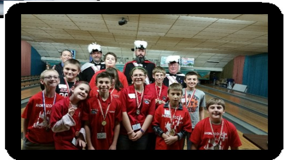
Special Olympics Bowling Team

Recreation Department continued to offer a variety of activities throughout the year. A sampling of just a few of our programs shown above. Hopefully you enjoy viewing them with as much pleasure as the children and adults seem to be having!