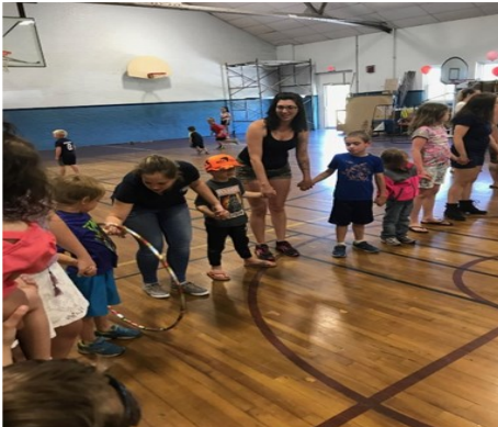
Playground Kick Off