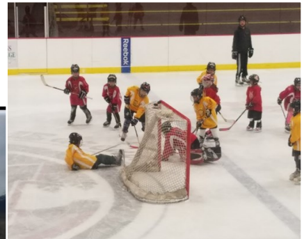
Recreational Hockey Development League