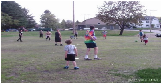
Parents v. Children Kickball