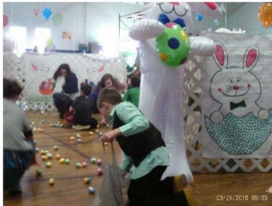
Children hunting for treats at Eggstravaganza

There were two wonderful additions to Berlin Recreation's 37 th Annual Easter "Eggstravaganza." First was the generous help from Hope for NH Recovery with the extensive decorating process. Their volunteer hours prepping the gym to create the Spring Easter look was much needed and greatly appreciated!